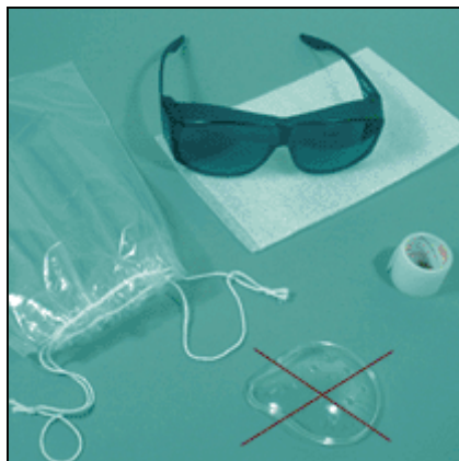
TE-671Y Super Economy